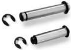
Art.-Nr. 1126040 Art.-Nr. 1126060